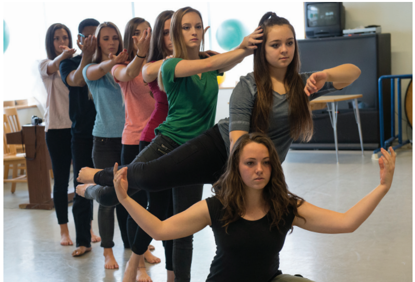
It's About You